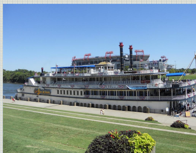
General Jackson Showboat