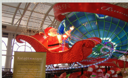
Galt House Kalightscope